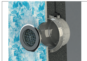
34600946: Mounting Box