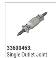
33600463: Single Outlet Joint